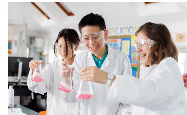
Mill Hill Summer/Spring School