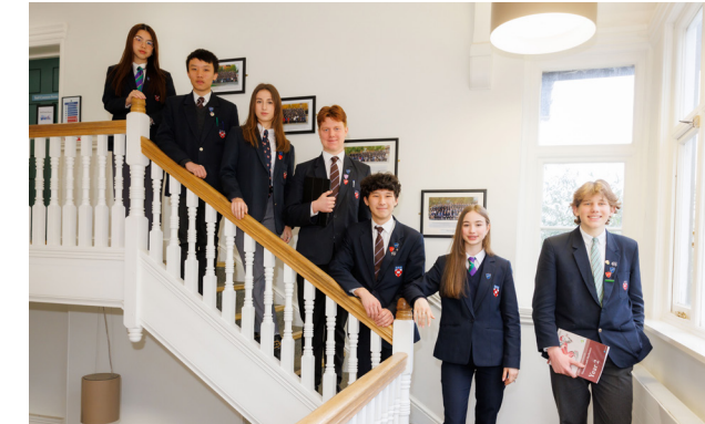
Mill Hill International