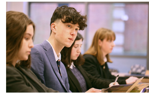
Mill Hill School